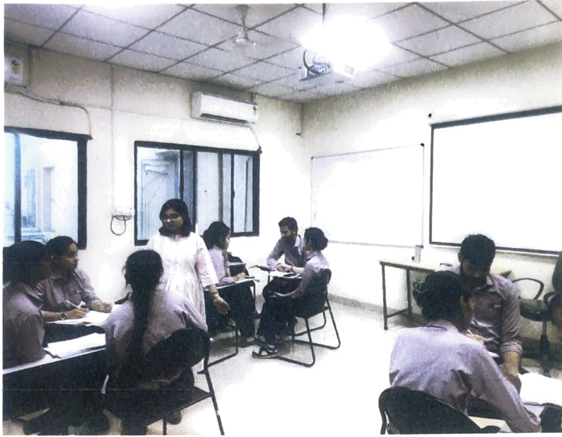
Students learning through teacher-directed group discussion